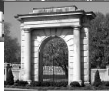
Main Entrance Gate