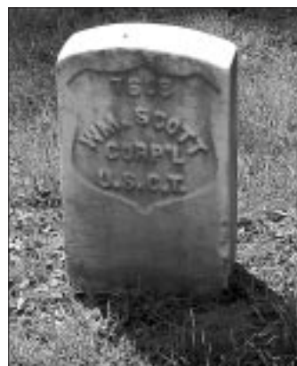
Many U.S. Colored Troops are buried at the National Cemetery.