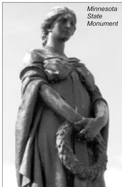
Minnesota State Monument