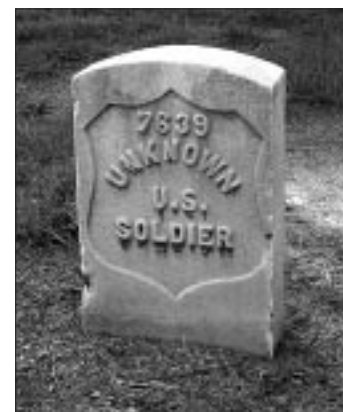
One of the many gravestones of unidentified U.S. soldiers.