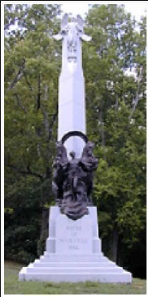
Battle of Nashville Preservation Society, Inc.