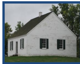
The Dunker Church – Antietam National Battlefield