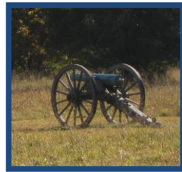
Stones River National Battlefield